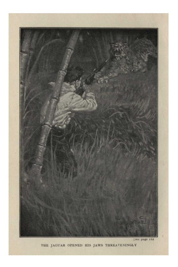
THE JAGUAR OPENED HIS JAWS THREATENINGLY (see page 182)