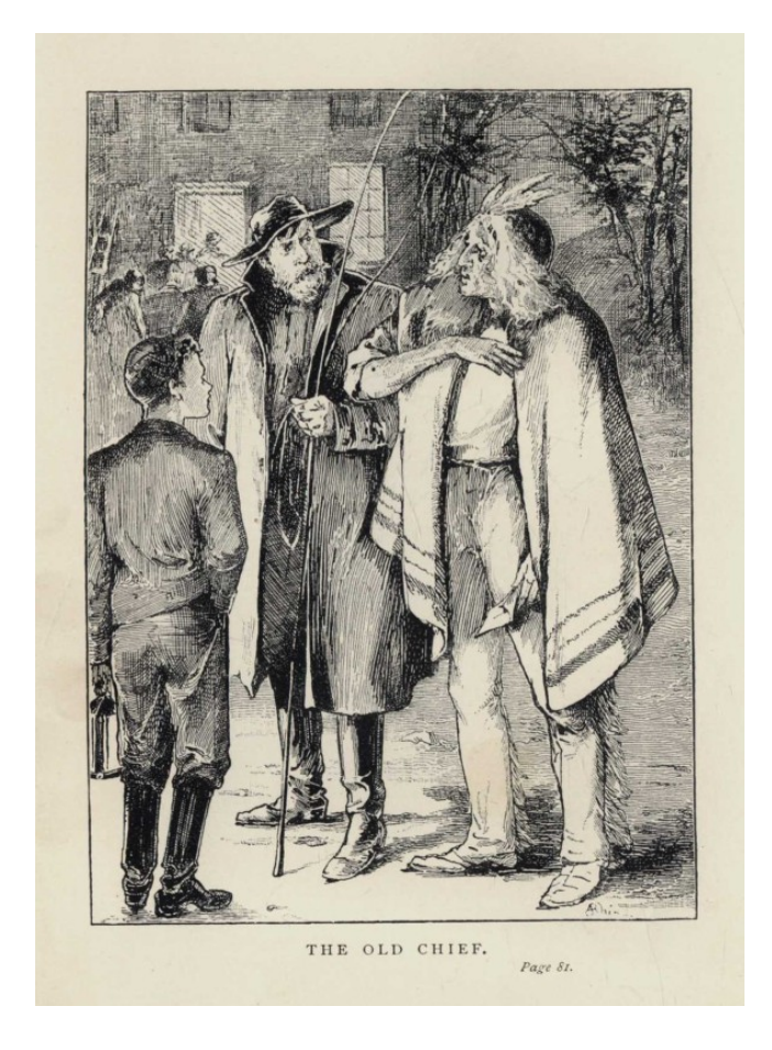
THE OLD CHIEF. Page 81.