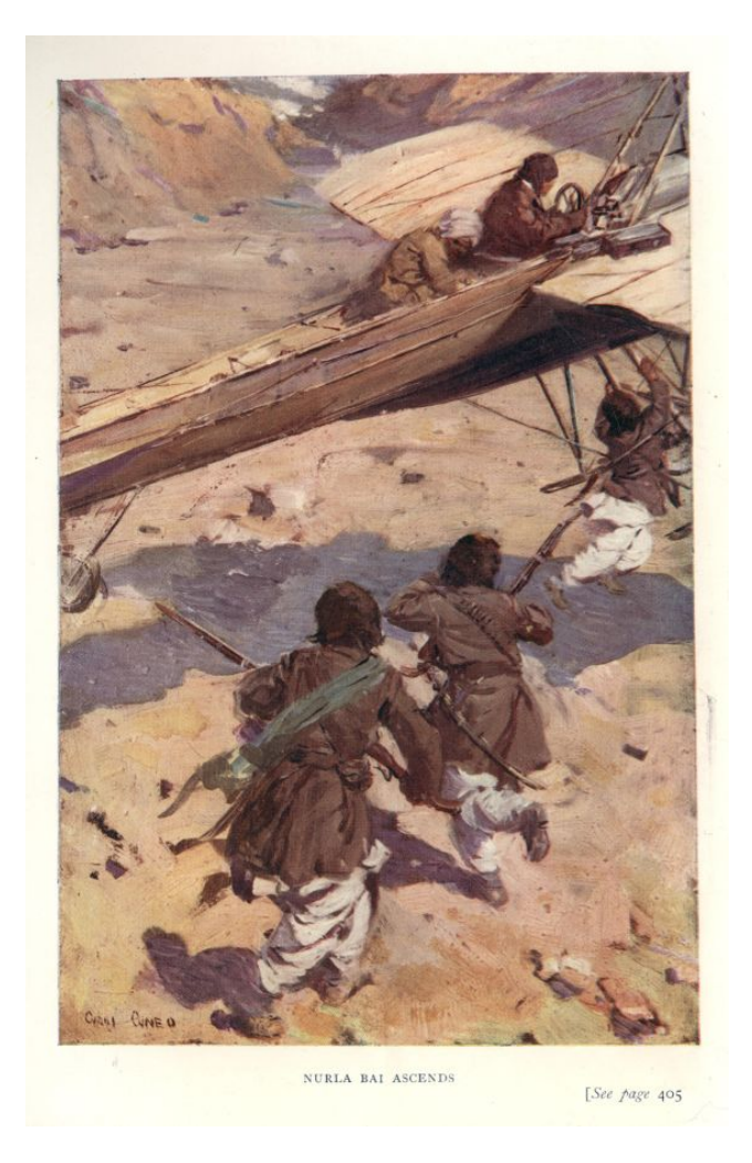
NURLA BAI ASCENDS. See page 405