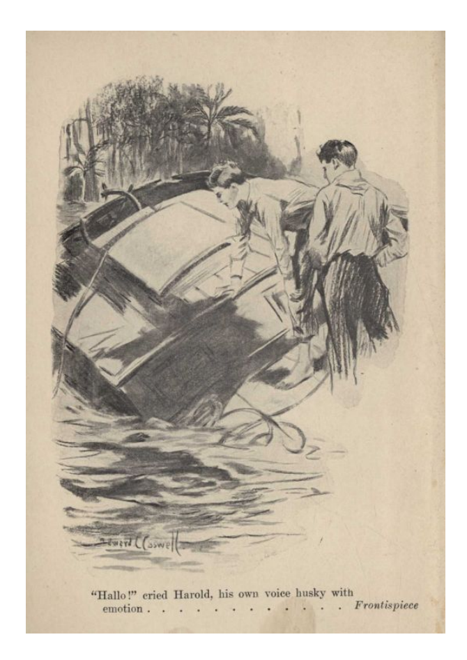
"Hallo!" cried Harold, his own voice husky with emotion . . . Frontispiece