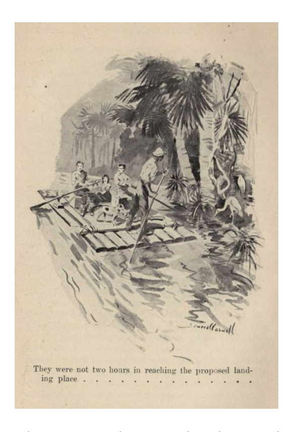
They were not two hours in reaching the proposed landing place