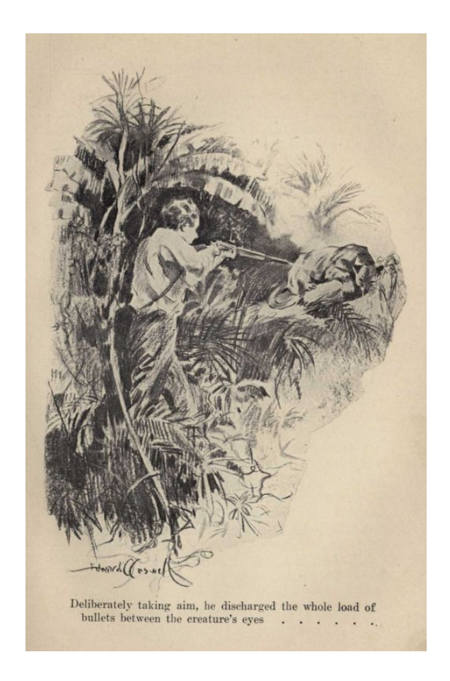
Deliberately taking aim, he discharged the whole load of bullets between the creature's eyes