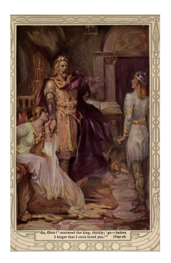
"Go, Olvir!' muttered the king, thickly; 'go-before I forget that I once loved you." (Page 467)