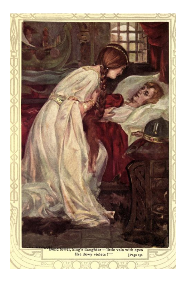
"Bend lower, king's daughter-little vala with eyes like dewy violets!" (Page 250)