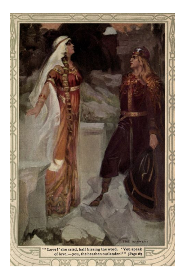
"Love!' she cried, half hissing the word. 'You speak of love,—you, the heathen outlander!'" (Page 163)