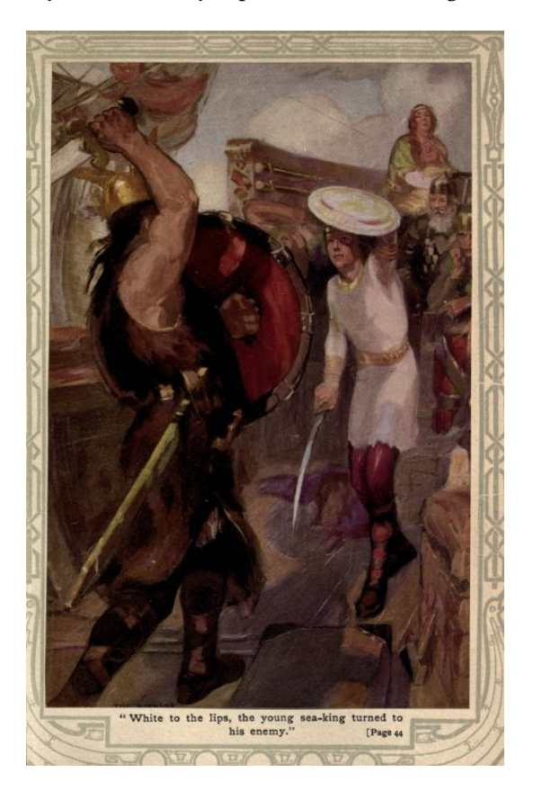
"White to the lips, the young sea-king turned to his enemy." (Page 44)

"So; the wily snake! Not my cup alone shall taste of gall."