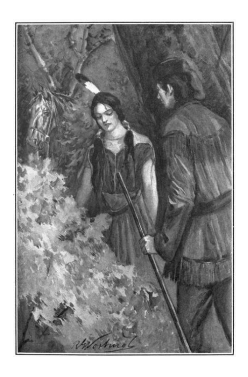
"THE CUSTOM IS THAT THE WITCH MUST DIE."