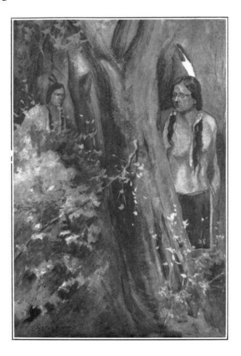
HE KEPT HIS EYES ON THE SENECA UNCEASINGLY.

"Will the Seneca go to Fort Pitt and there put Little Paleface on trial before those whose customs are the customs of the Palefaces? No, of course he will not. And just so would it not be fair for Lone-Elk to demand more than he would be willing himself to give."