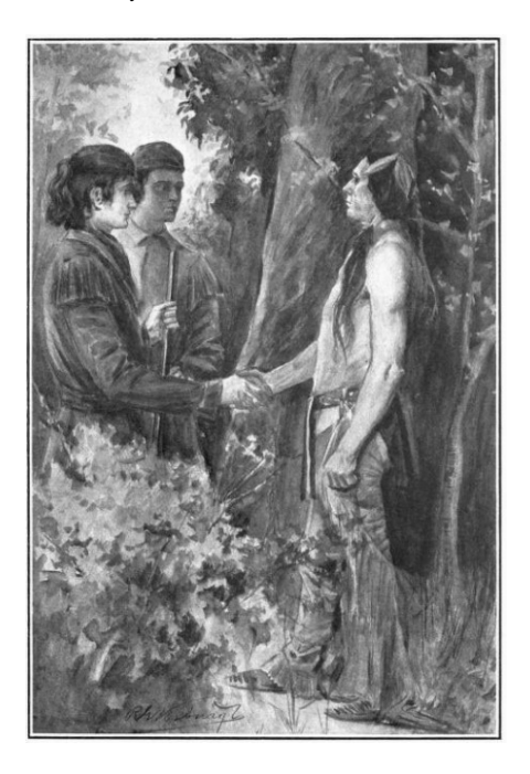
THEY ASKED HIM TO GO WITH THEM.

In an instant Lone-Elk was on his feet. With head thrown back and flashing eyes he repeated the story of the cloud which drifted over the lake—repeated again the whole miserable tale he had told so many times before. Then he exhibited the hatchet taken from the shock of corn on which a crow of most strange appearance had the same day been seen.