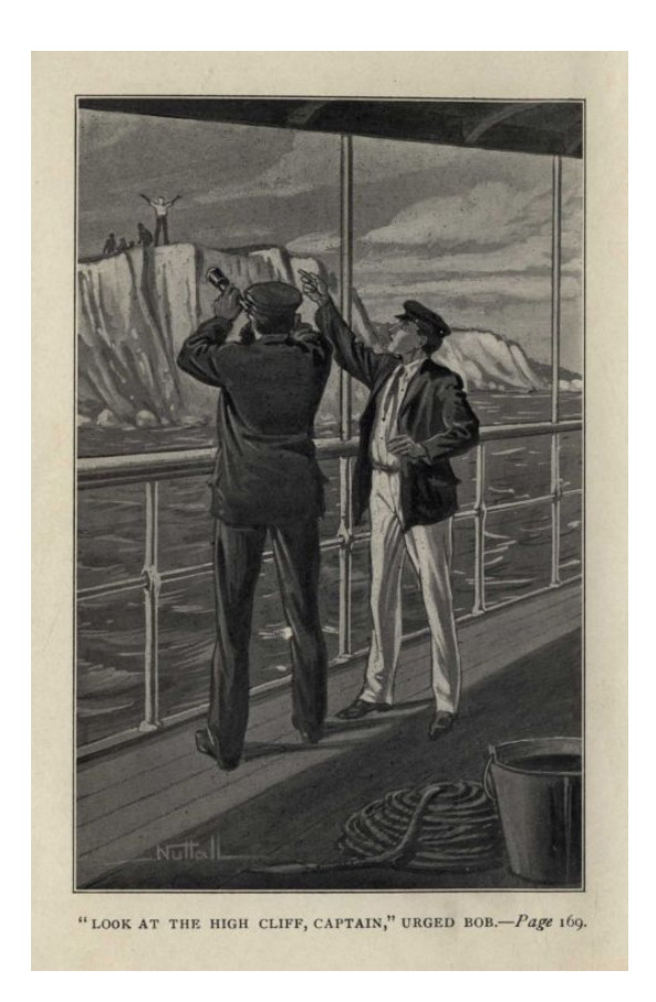
"LOOK AT THE HIGH CLIFF, CAPTAIN," URGED BOB.–Page 169.