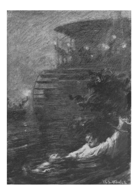
With his right hand he raised the man's head above the current.