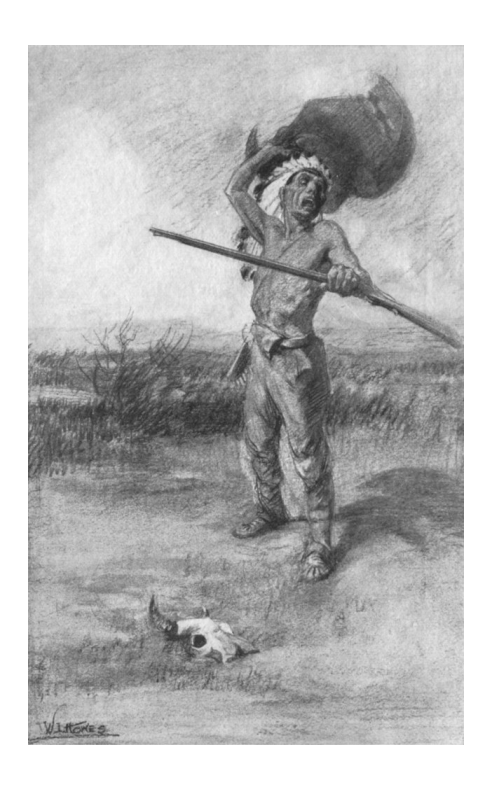
"Come out, you white men, and fight!"