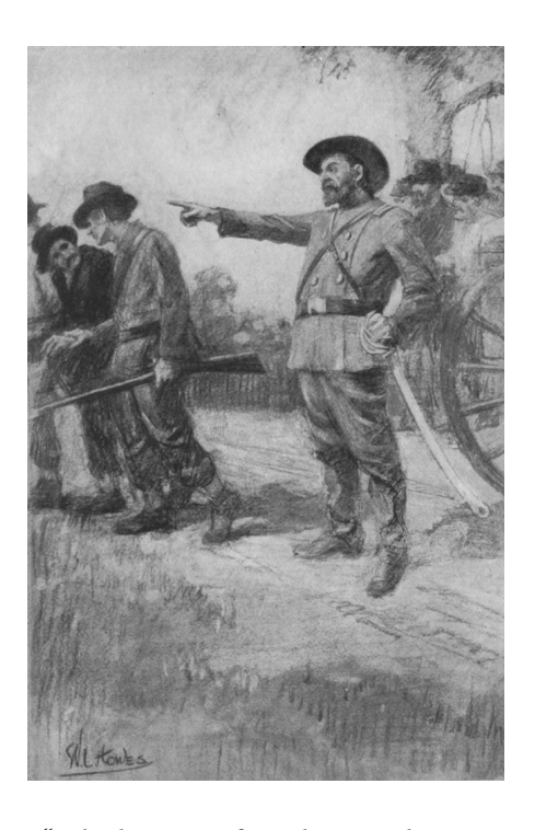
"Take him out of our lines to that open field."

"That sounds good," said the officer, "the transport Northern Star leaves for St. Louis to-night or to-morrow. She is short of men. Restler and Stone, take these men back to Haynes Bluff and turn them over to the captain of the Northern Star . Tell the captain he will furnish me a good dinner when he returns from St. Louis."