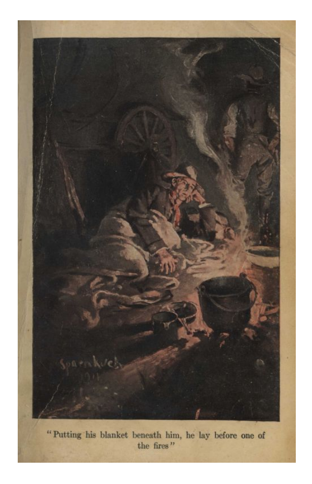
"Putting his blanket beneath him, he lay before one of the fires"