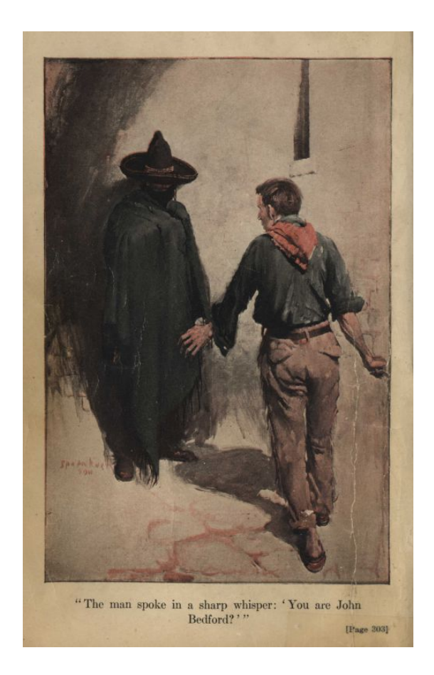
"The man spoke in a sharp whisper: 'You are John Bedford?'" Page 303