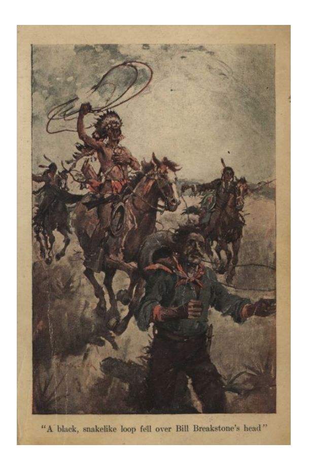
"A black, snakelike loop fell over Bill Breakstone's head"