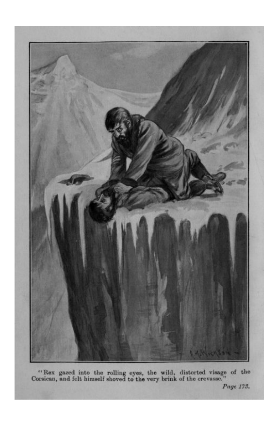
"Rex gazed into the rolling eyes, the wild, distorted visage of the Corsican, and felt himself shoved to the very brink of the crevasse." Page 173.]