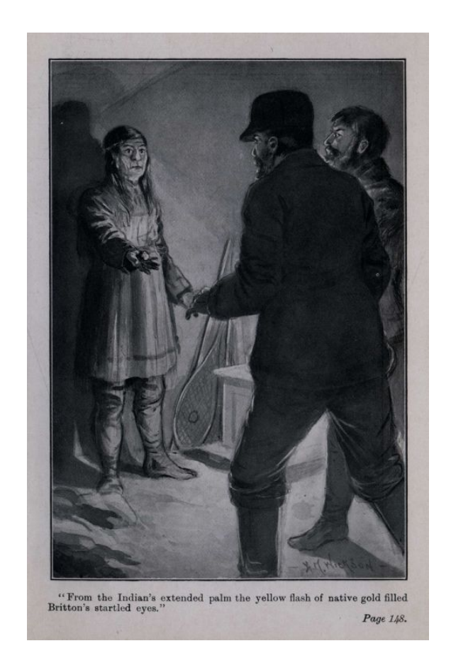
"From the Indian's extended palm the yellow flash of native gold filled Britton's startled eyes."