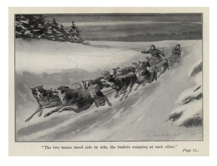
"The two teams raced side by side, the leaders snapping at each other."

Invited into a race, the girl soon showed the mettle of herself and of her animals. Before Britton reached the river-arm, she drew abreast. The trail sloped downward, and the dogs had but little to stay their lope. The two teams raced side by side, the leaders snapping at each other.