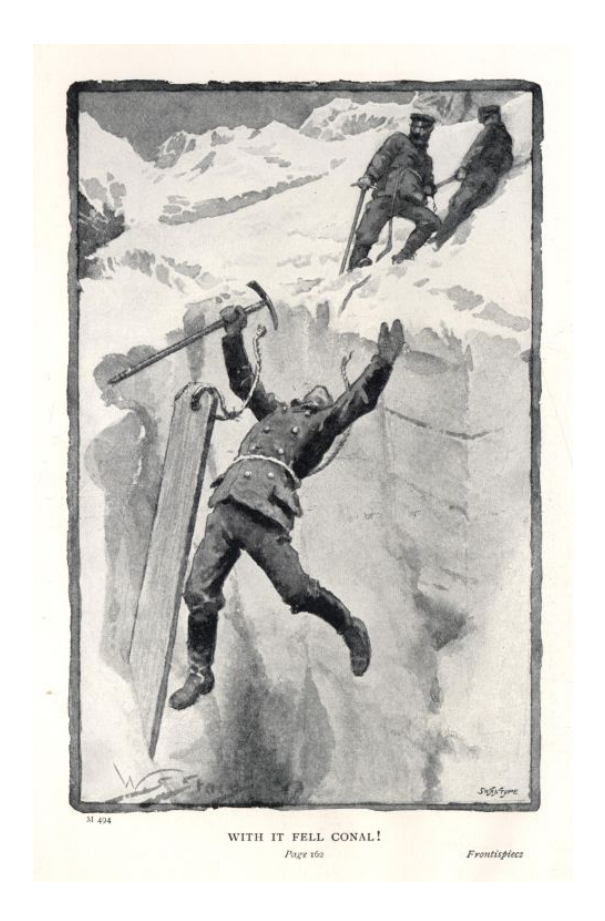
WITH IT FELL CONAL! Page 162