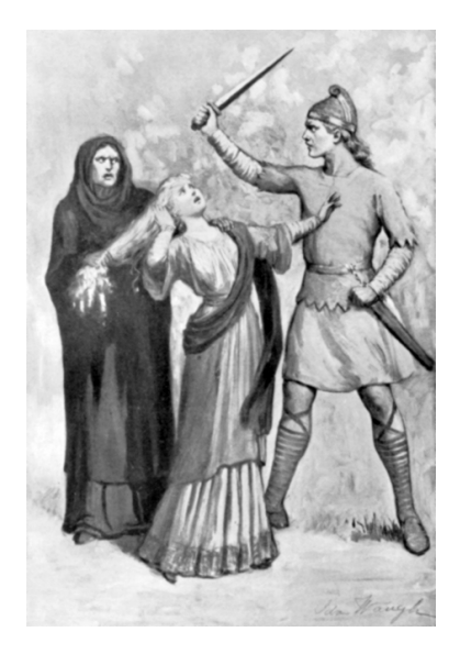
HE RAISED THE SEAX AND THE BLOW FELL.

It was true. Elated by their triumph, the Saxons pursued the flying Danes, and great was the slaughter. Great also was the booty they obtained from the camp, and, among other things, the magical banner of Hubba, under which the chief lay dead.