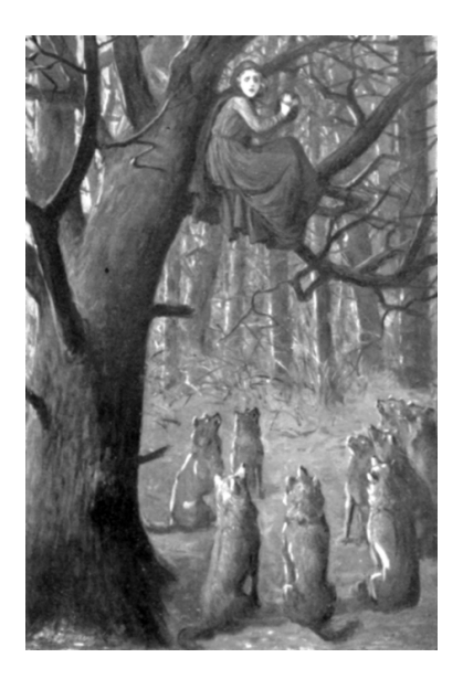
SHE BEGAN STRIKING THE CYMBALS TO-GETHER.

from her, for they took the courage out of her heart and sapped the strength of her body.