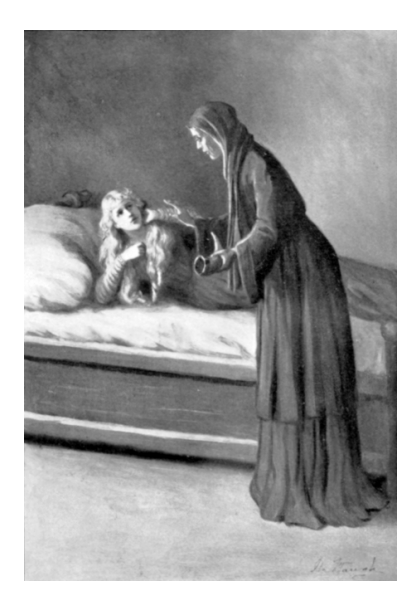
"TWILL LULL THEE TO DREAMLESS RE-POSE."