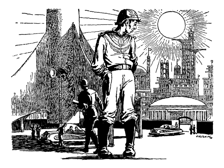
Illustrated by Paul Orban

nishings from the adjacent village. When the inhabitants returned, after the purposes of the visiting Earthman were acknowledged to be harmless, they proved to be too courteous to carp about a few missing articles.