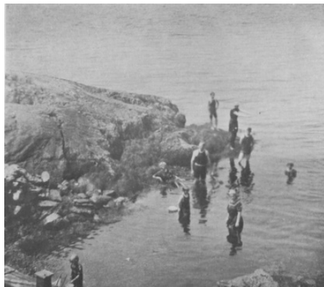
A DIP IN THE "BRINY DEEP."

Eleanor ran away and Zan looked at the Guide, but her face expressed nothing that would encourage the girl to criticise the indolent member of the Band.