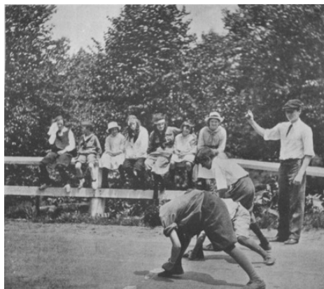
A RACE, WHILE "WAKO" SAT ON THE FENCE.

"I wasn't quite sure of what I was supposed to do, so I collected a few short notes—but I can do better next time, Miss—O Chief!" explained Mildred.