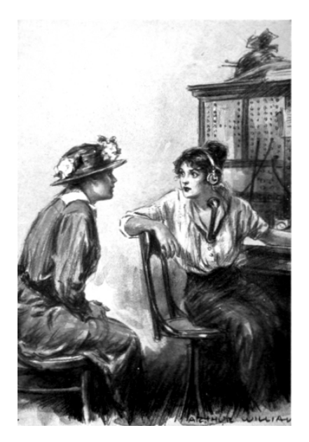
'Mark my words, there's going to be trouble at Mapleshade'"