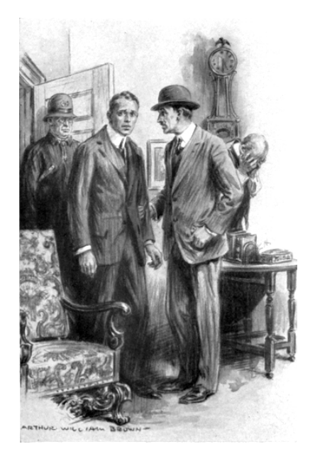
A day later he was arrested at Firehill and taken to Bloomington jail