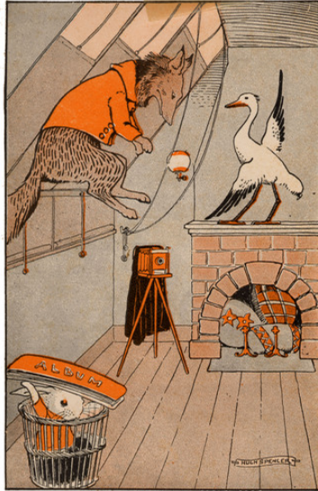
DOWN THROUGH THE CEILING DROPPED DADDY FOX.

“BILLY BUNNY AND THE FRIENDLY ELEPHANT,” “BILLY BUNNY AND UNCLE LUCKY LEFTHINDFOOT”