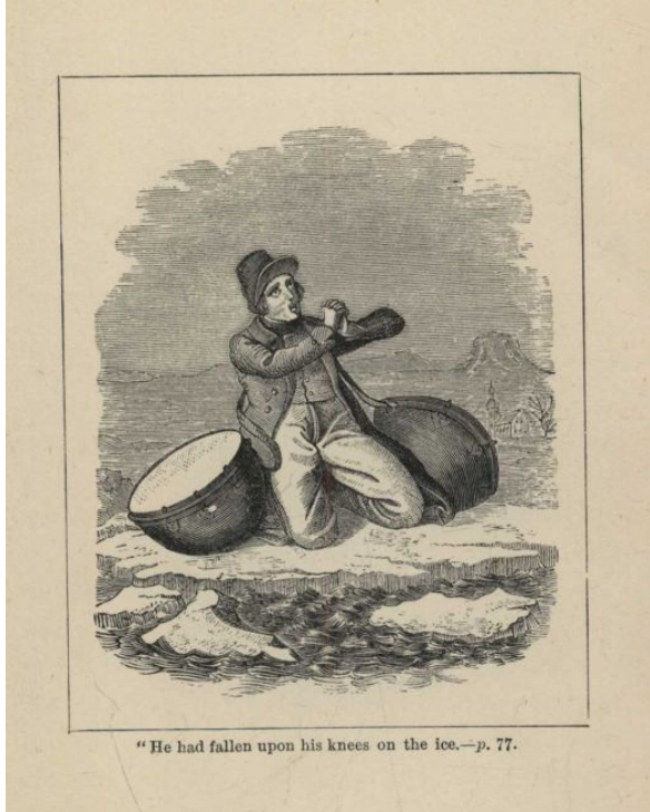
"He had fallen upon his knees on the ice.—p. 77.

"He had fallen upon his knees on the ice."