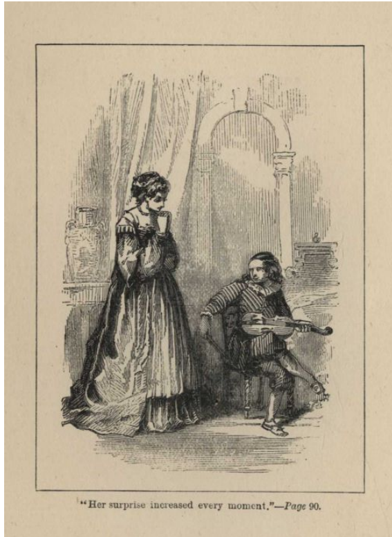
"Her surprise increased every moment."—Page 90.