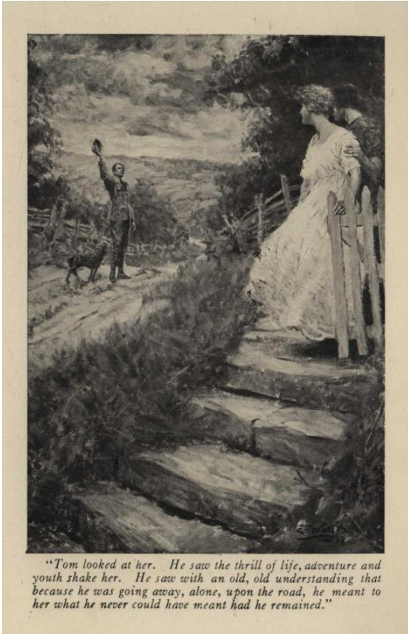
"Tom looked at her. He saw the thrill of life, adventure and youth shake her. He saw with an old, old understanding that because he was going away, alone, upon the road, he meant to her what he never could have meant had he remained."

"Tom looked at her. He saw the thrill, of life, adventure and youth shake her. He saw with an old, old understanding that because he was going away, alone, upon the road, he meant to her what he never could have meant had he remained."