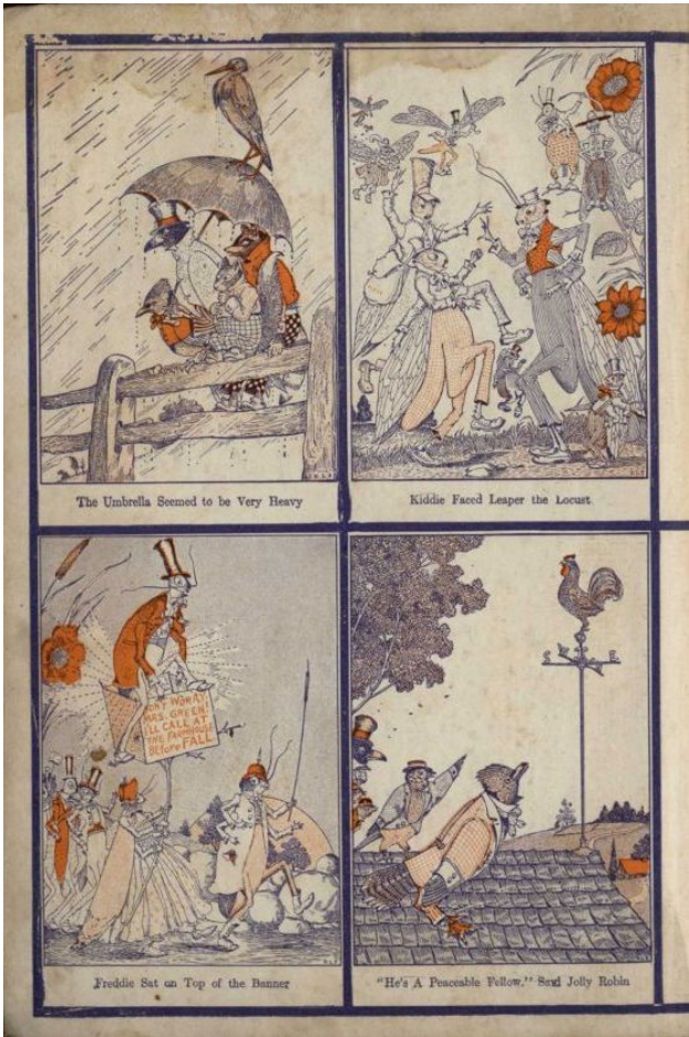
Rear end paper - left half