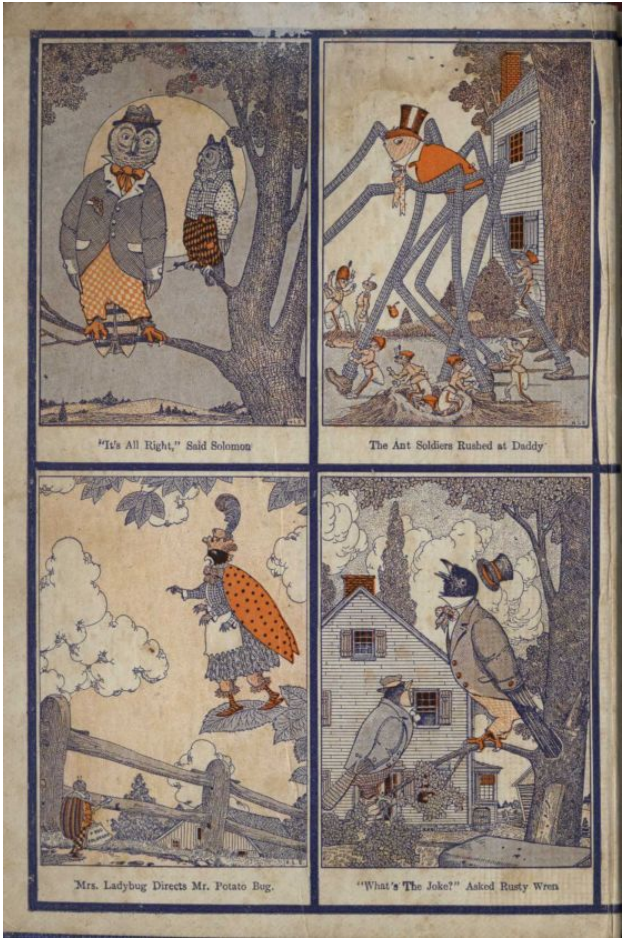
Front end paper - left half