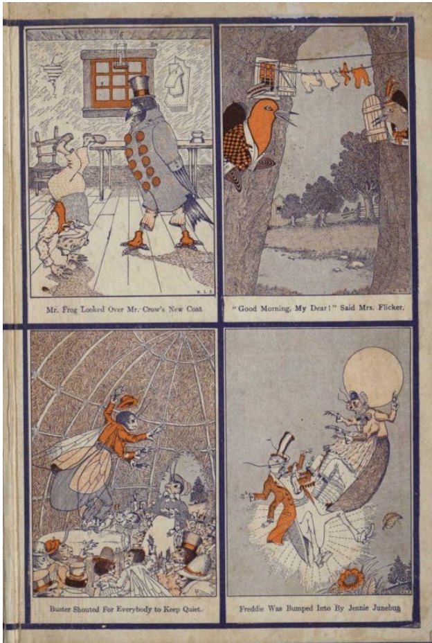
Rear end paper - right half