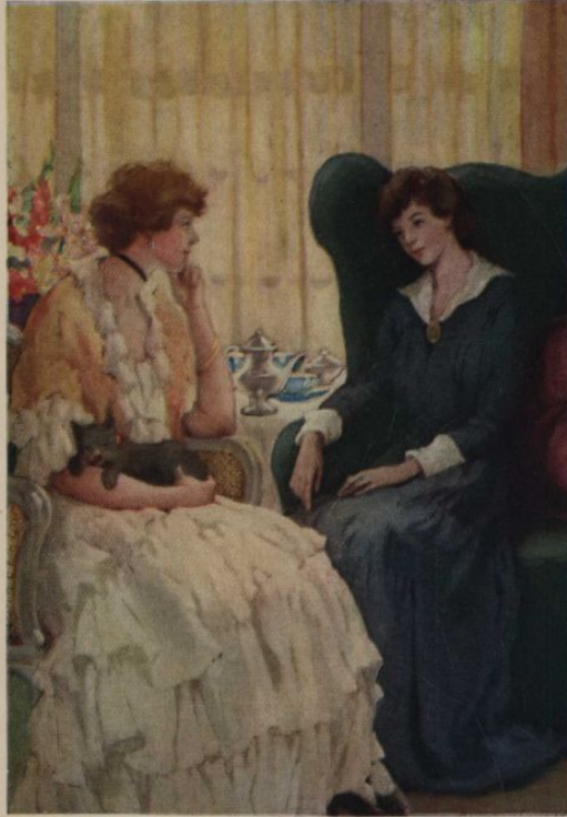
SHE PUT ALEXANDRIA INTO THE MOST COMFORTABLE OF HER CHAIRS AND DREW ANOTHER CLOSE TO IT