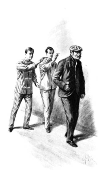
"The procession of three led by the stranger."

for before he could do either he was taken in the rear and found himself a target. There stood the Duke in his pajamas, with a handy little Smith and Wesson not a foot from the intruder's temples, and with his left hand significantly extended.