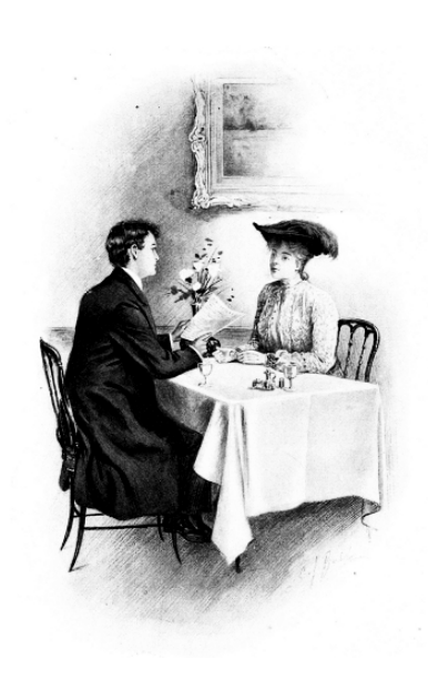
"I am very far from being indifferent to Mrs. Talmage Eglinton."

"I certainly did not follow you with a bad motive, and—there, a straight question deserves a straight answer—I am very far from being indifferent to you, Mrs. Talmage Eglinton," he said.