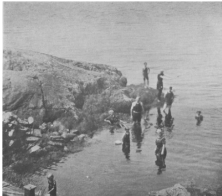
A DIP IN THE "BRINY DEEP."

Eleanor ran away and Zan looked at the Guide, but her face expressed nothing that would encourage the girl to criticise the indolent member of the Band.