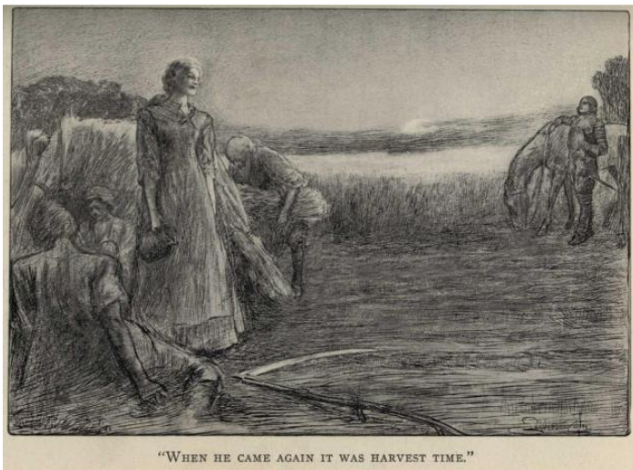
"WHEN HE CAME AGAIN IT WAS HARVEST TIME."

"Farewell, Jane! Darling Jane!"—then, afraid of his own temerity, he was away ere he could see the wonder and joy called into her face by the sweet familiar words.