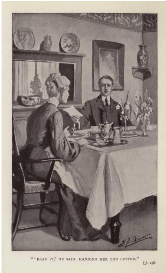
“READ IT,” HE SAID, HANDING HER THE LETTER.”