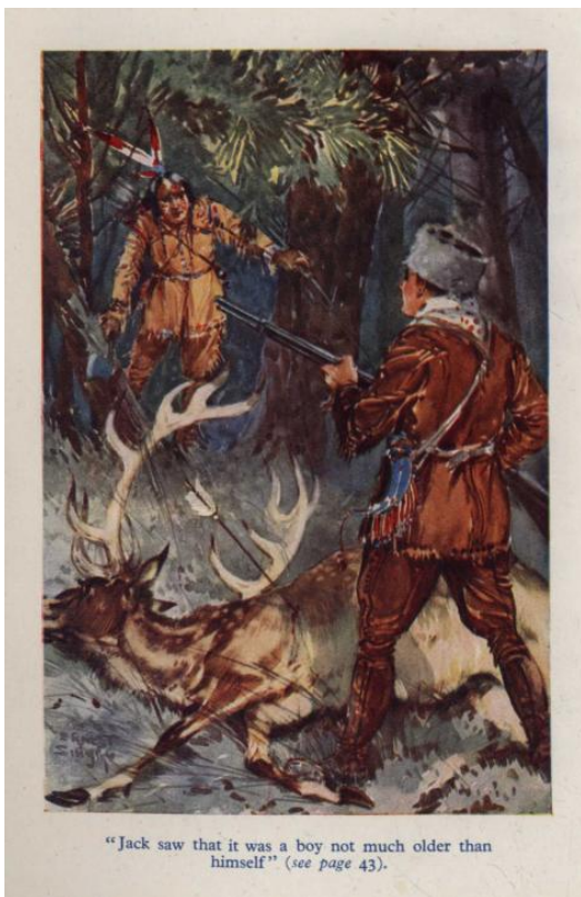
"Jack saw that it was a boy not much older than himself" (see page 43).