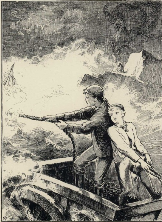
A PERILOUS RESCUE.