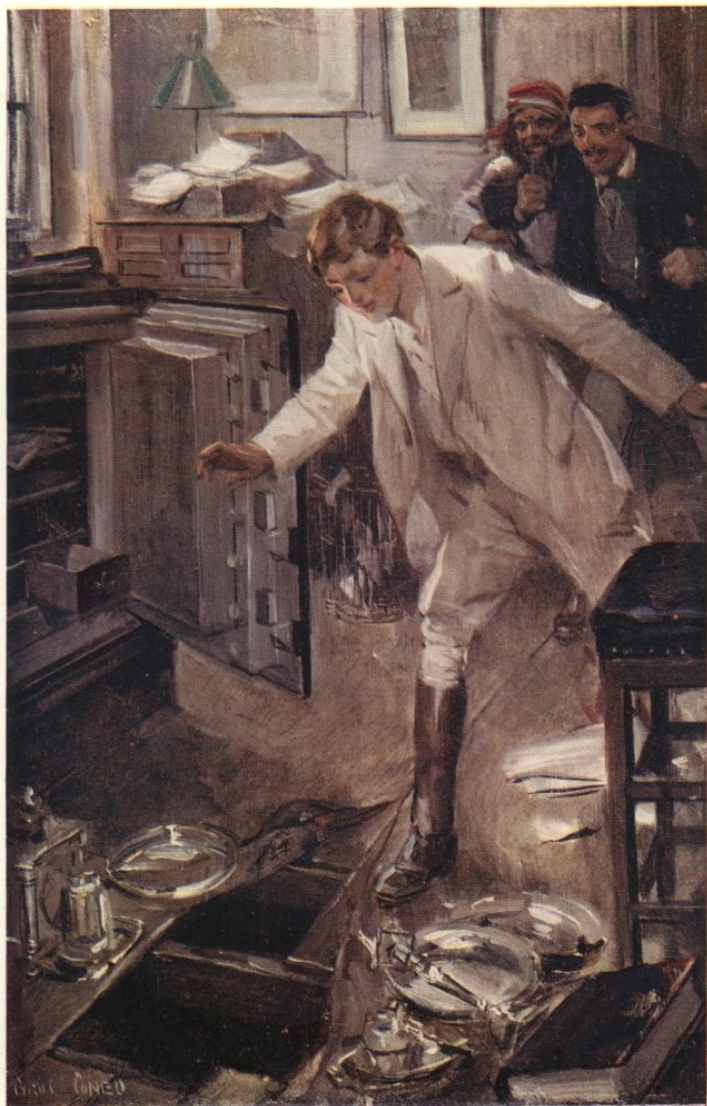
THE HOLE IN THE FLOOR