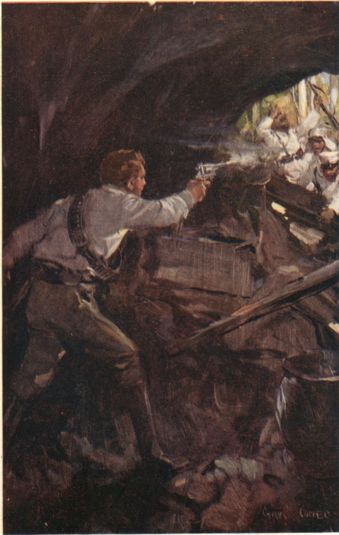
A CHECK AT THE CAVE