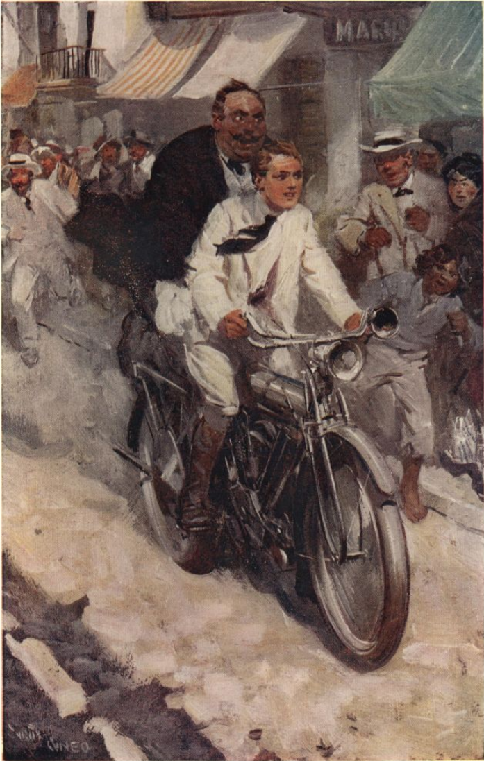
THE GOBERNADOR RIDES