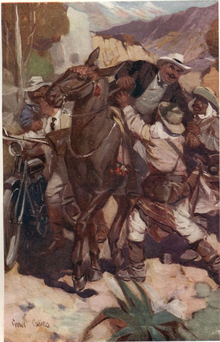
CAPTURED BY BRIGANDS