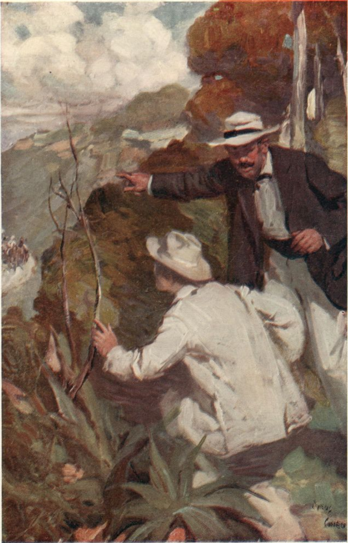
HORSEMEN ON THE TRACK