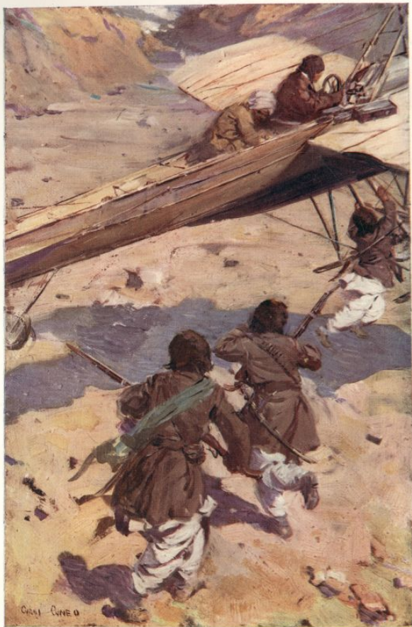
NURLA BAI ASCENDS