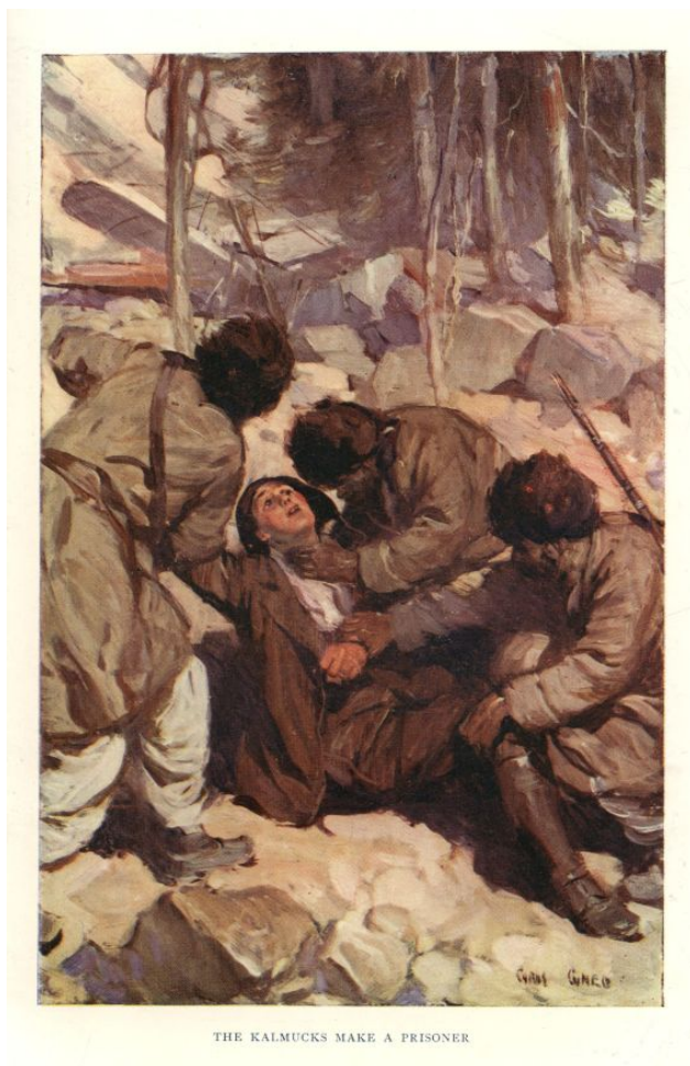
THE KALMUCKS MAKE A PRISONER