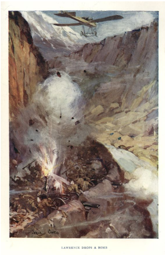
LAWRENCE DROPS A BOMB