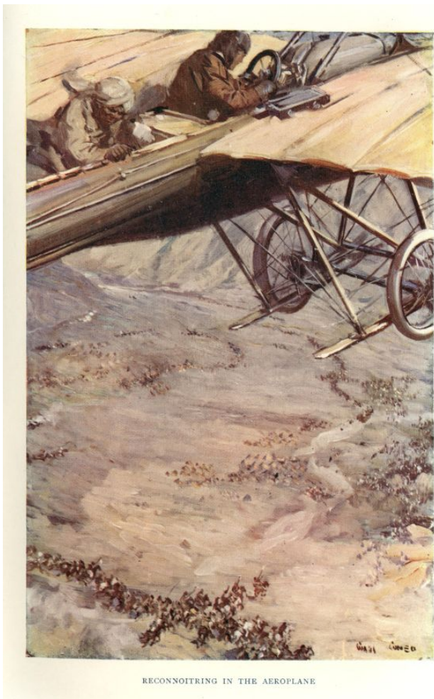
RECONNOITRING IN THE AEROPLANE