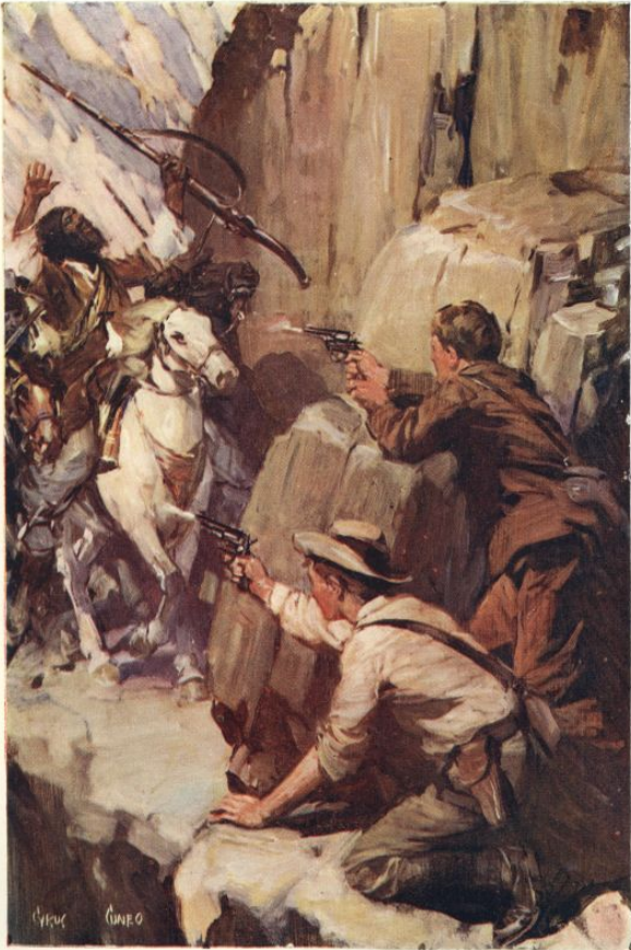
A CHECK IN THE PURSUIT