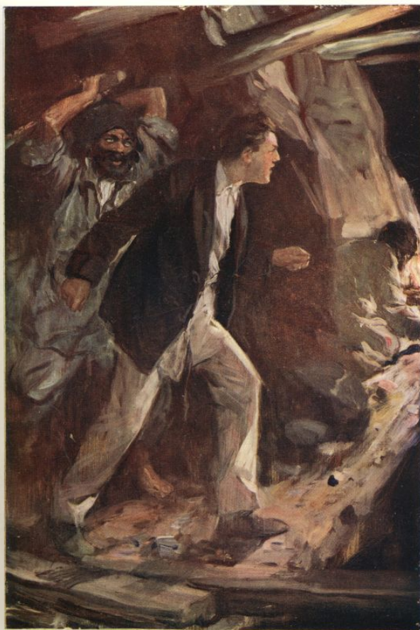
THE ATTACK IN THE GALLERY

once made up his mind to steal upon the man, seize him, and haul him before Mr. Appleton. He crept forward; there were only about a dozen paces between the two. But while he was in the very act of making his leap, he was conscious of a rush of feet behind him. Next moment he was struck by a heavy object, and fell on his face to the floor of the gallery. His head hit the hard rock; there was one instant of intense pain, and then his senses forsook him.