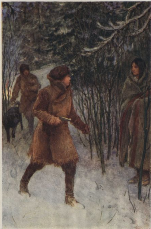
Motionless before her stood a figure wrapped in the usual Indian blanket. p. 100