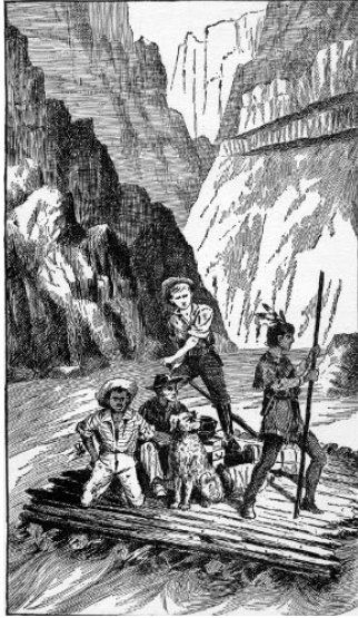
Sam succeeded in guiding the raft to a ledge of sloping rocks.

At the discovery Sam could not restrain a cry of joy, and even Ulna's usually impassive face was illuminated with the light of hope.